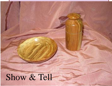
Show & Tell

"Demonstrations, Show and tell & Silent Auctions every meeting."