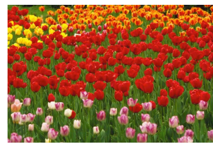
Spring is coming.