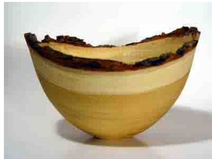
Mulberry Natural Edge

The Central Virginia Woodturners (CVW), a newly affiliated chapter of the American Association of Woodturners, has thirty-three charter members as it looks toward its March meeting on Tuesday, March 16, 2004 at 7:00 p.m.