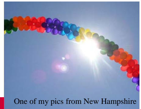
One of my pics from New Hampshire