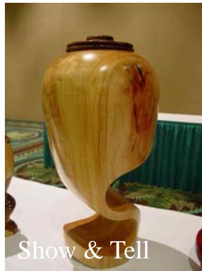
Show & Tell

Shirts and caps are in and will be available at the meetings. Shirts will be reduced to $15 and the caps will be $11. The club will be able to make a few dollars on each item, so buy some extra's. (2XL and 3XL add $1.50)