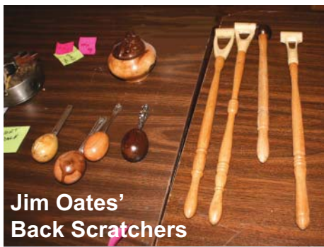
Jim Oates' Back Scratchers